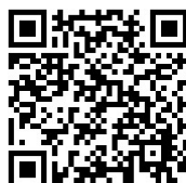
Find a Group