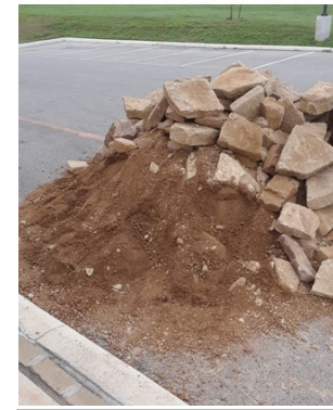
3. Exposing the mulch.