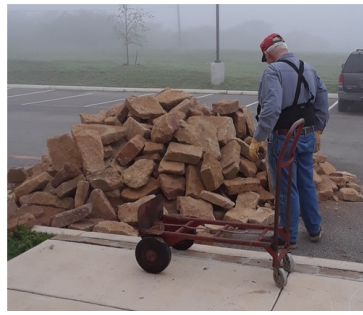
1. The pile of rocks on top of the crushed granite mulch.

Thank you for generously helping people in need in our community!