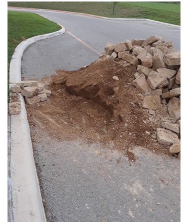
8. The pile after some rocks and mulch are moved.