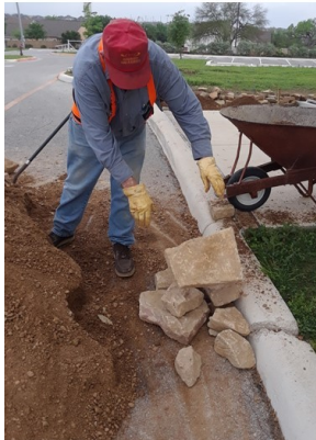
5. Temporary storage of large rocks so mulch can be moved.