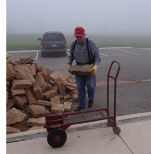
2. Loading larger rocks onto dolly. These will go by the Mission Field sign.