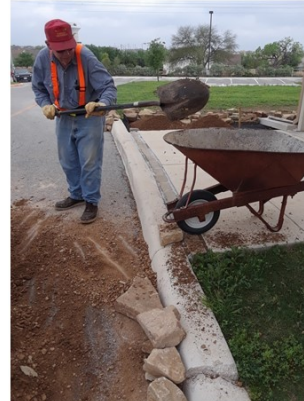
6. Loading the wheelbarrow about half full. Note the rock blocking the wheel.