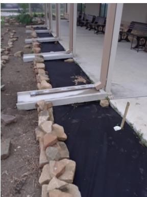
7. Push the wheelbarrow on the porch to dump in the bed area. Do not spread now.

If you're going stir crazy and want to do some work, check out Wayne Flowers' 20 minute workout! We are keeping the entry gate at church locked, so if you need access give Wayne a call, 210-213-1362. Thank you for your help!!