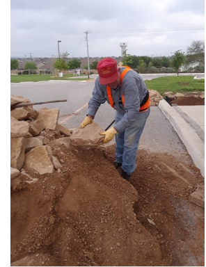
4. Rocks can be moved off the mulch and to the side.