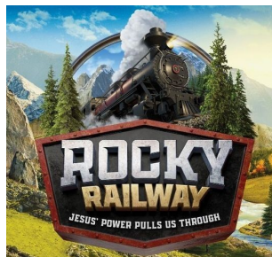
Backyard VBS online